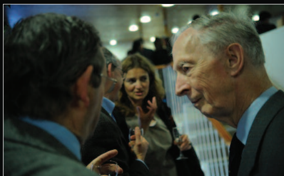
Guests at the Ashby Reception