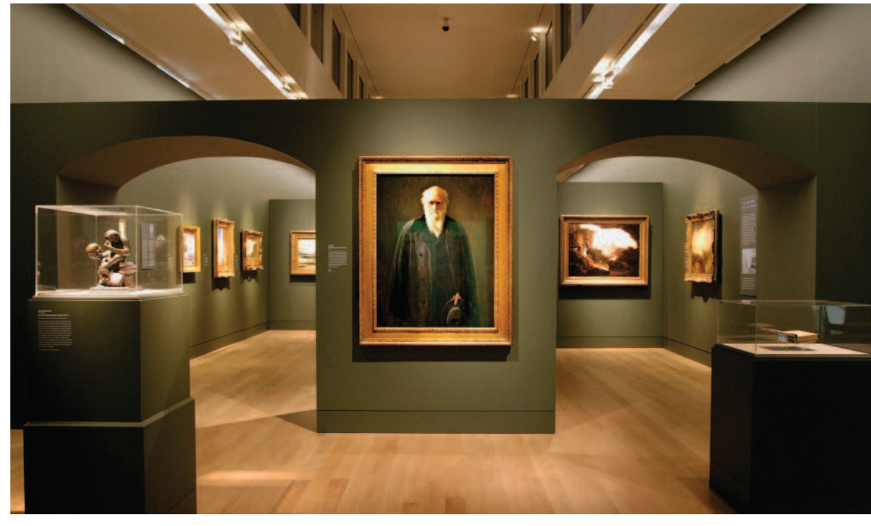
Darwin Exhibition at the Fitzwilliam Museum.